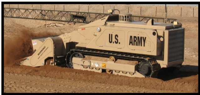
Figure 2: M160 (manufactured by Dok-Ing)