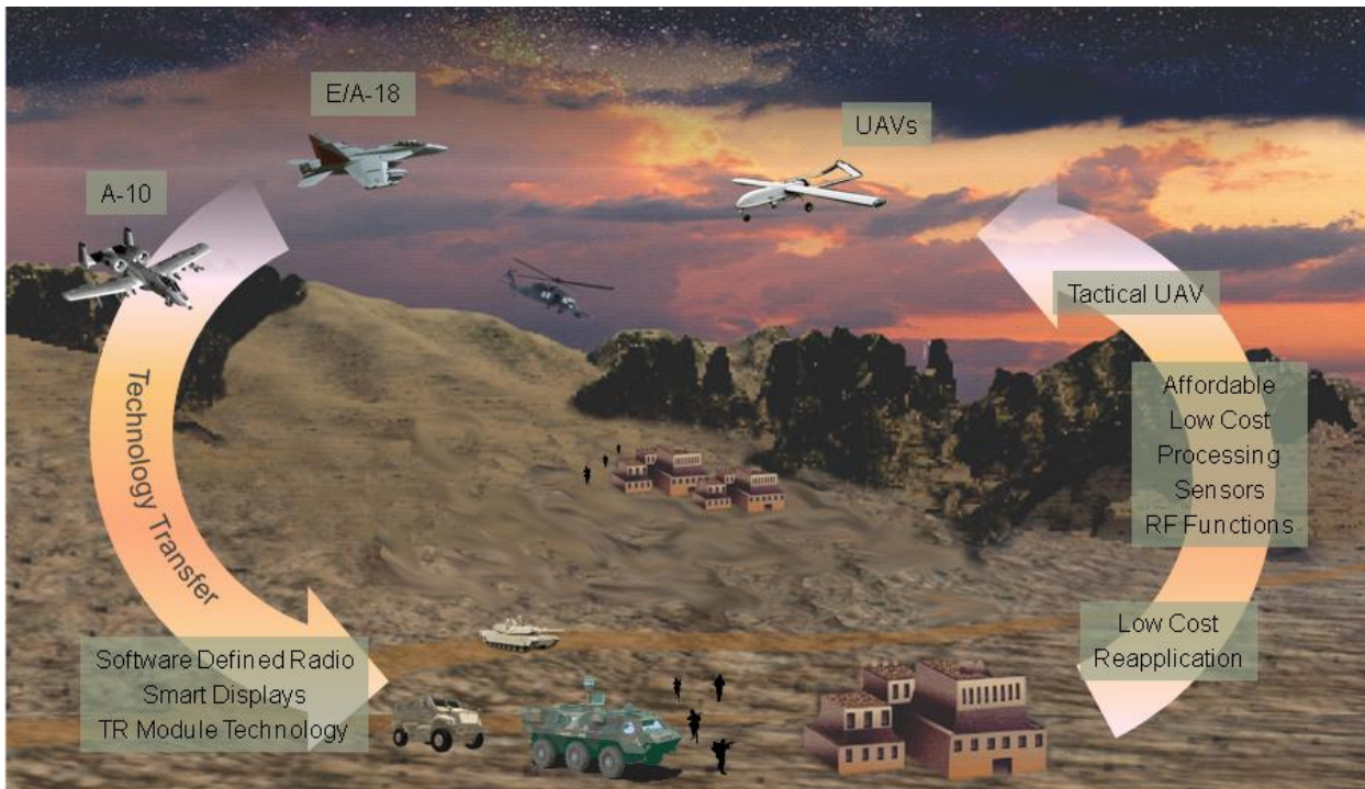
Figure 2: Technology Transfer Operational View

This paper will discuss the application and collaboration of architectures, mission technologies and ground/air integration opportunities. The reasons that government and industry stakeholders should consider dialog and action for these topics are presented as well along with the proposed near term actions. The philosophy of this approach is illustrated in an operational view of the proposed technology transfer as shown in Figure 2 .